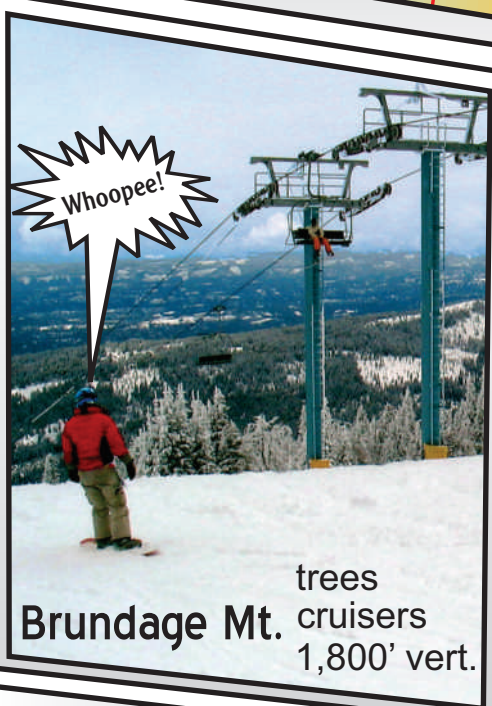
Brundage Mt. trees cruisers 1,800' vert.

Reserve your own hotel room. Call the hotel at: 208-634-2230 and tell them you are with the Mt. High club. Then notify Linda.