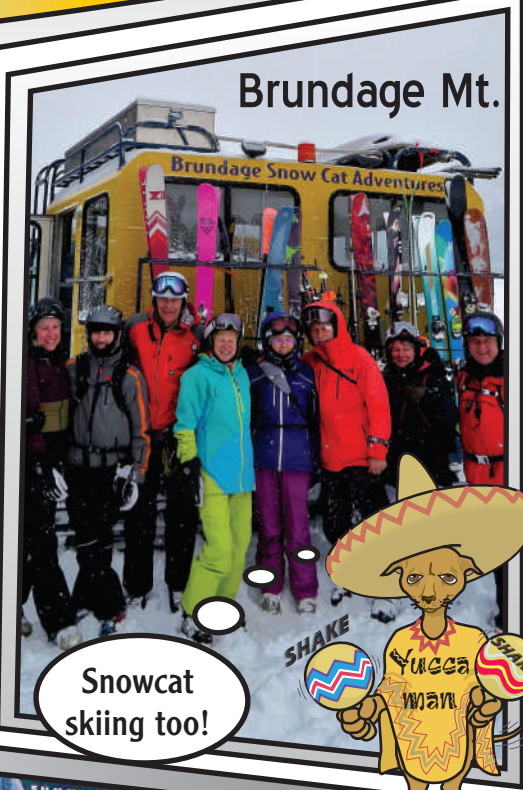
Snowcat skiing too!