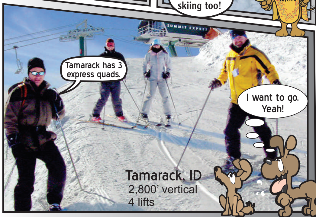
Tamarack, ID 2,800' vertical 4 lifts