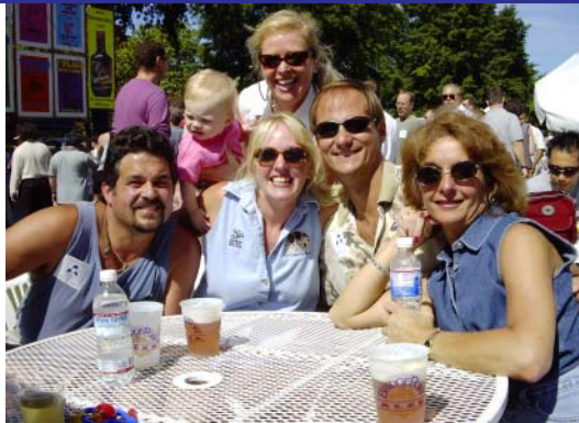
Happy Mt. High members at the "Bones & Brew" a couple of years ago

NOTE: Parking garage is on the other end, closer to REI.