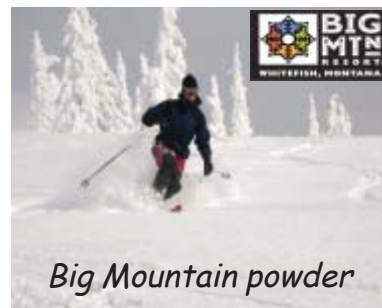
Big Mountain powder

We'll leave Portland, via Amtrak at 4:45 p.m. on Wednesday, Feb. 16 th , arriving in Whitefish, Montana at 7:30 a.m. on Thursday, ready for a day of skiing. After skiing, we'll check into our beautiful rooms at Grouse Mountain Lodge.