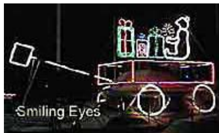
Christmas Ships Social Dec. 8 (Mon.)