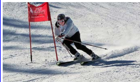
Learn about racing Dec. 3 (Wed.)