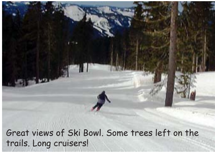
Great views of Ski Bowl. Some trees left on the trails. Long cruisers!