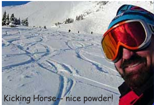
Kicking Horse-- nice powder!

See trip planning details and maps in the Articles section of our web site.