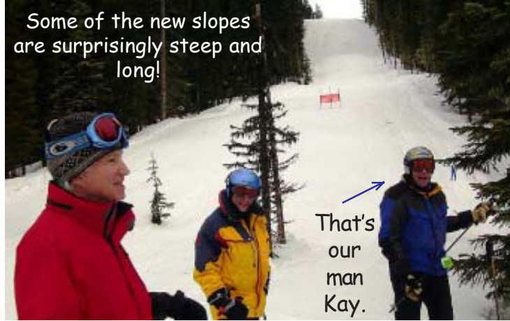
Some of the new slopes are surprisingly steep and long!