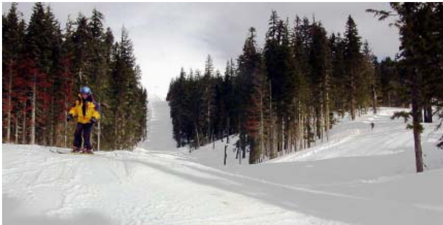
Three new trails meet here: JoJaMi (out of the photo, left), Mustang Sally (the steep one ahead) and Pete's Plunder (right).