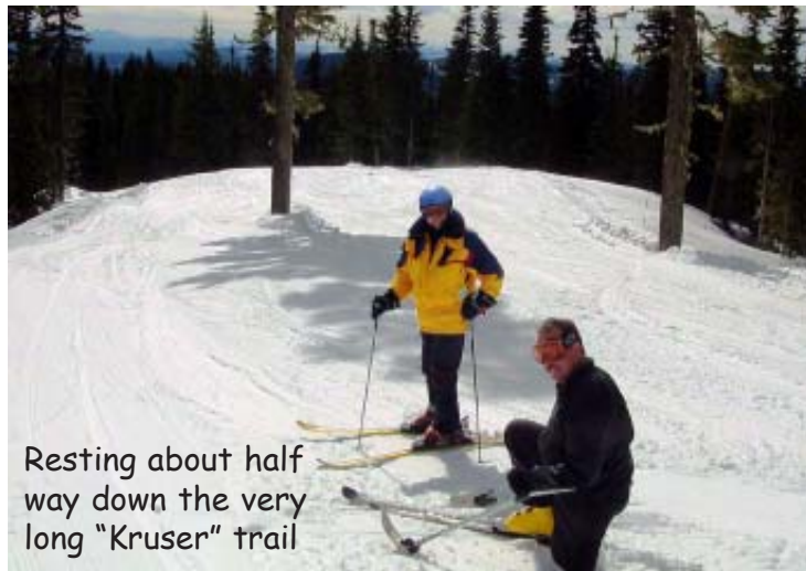
Resting about half way down the very long "Kruser" trail

The new lift will be located about half way between the Pucci and the Stormin' Norman's lifts, and descend at least another 1000' feet below West Leg Road. The top station will be near the bottom of the Magic Mile lift.