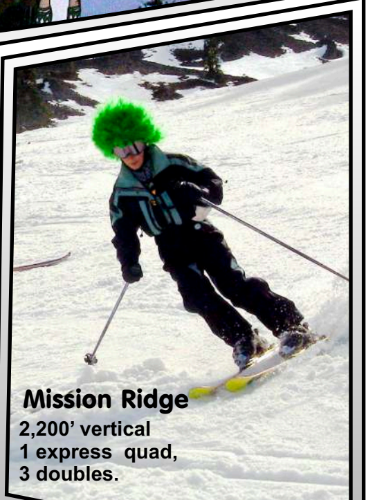
Mission Ridge 2,200' vertical 1 express quad, 3 doubles.