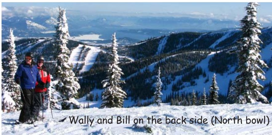
Wally and Bill on the back side (North bowl)