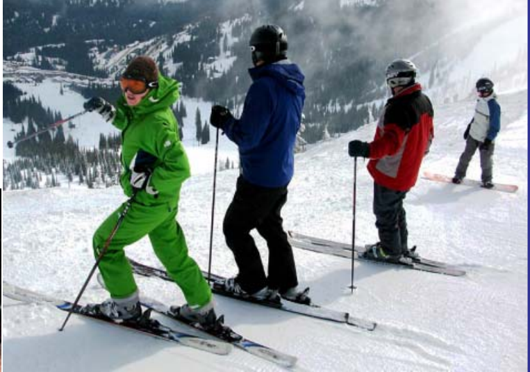
Only a small part of the front side of Schweitzer Mt.