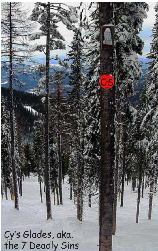
Cy's Glades, aka. the 7 Deadly Sins