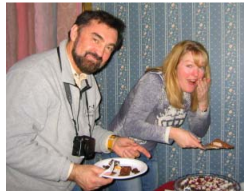
Judges finally agree!