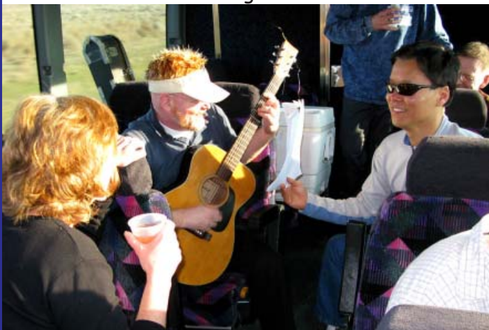
Jokes and songs on the bus.