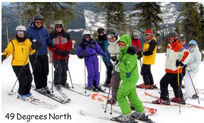
49 Degrees North