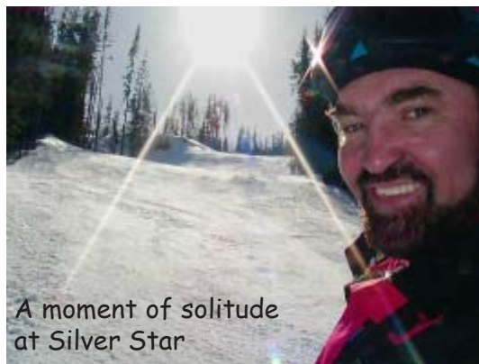
A moment of solitude at Silver Star

DAY 5 (Wed., Dec. 12): Ski Kicking Horse . We've been hearing a lot about it. It's time to ski it! Over 4,000 vertical feet in a single 10-minute gondola ride. 4 bowls. Great views of the Columbia River valley below. The on-mountain village is still rudimentary. We might want to stay in the town of Golden, only 15-20 minutes below the ski area.