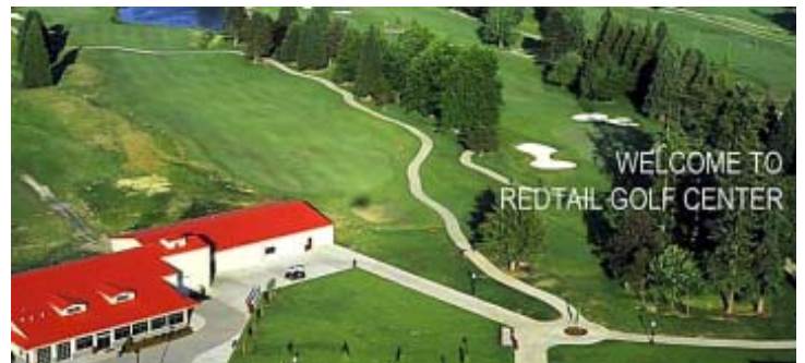
Redtail golf center, just one of the many possibilities

E-mail me (Cal Eddy) at baebaw@ccwebster.net or by phone: 503-631-3115 or 503-805-8606.