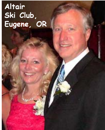
Altair Ski Club, Eugene, OR

Mountain High won first place in the Outstanding Club competition, in the AAA category, which are clubs with over 200 members. With 208 members, we have just grown to over 200 members this past season!