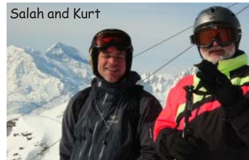
See more photos at www.mthigh.org/PhotosRecent.htm.