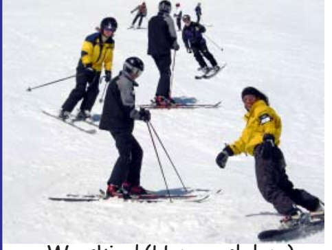
We skied (Human slalom)