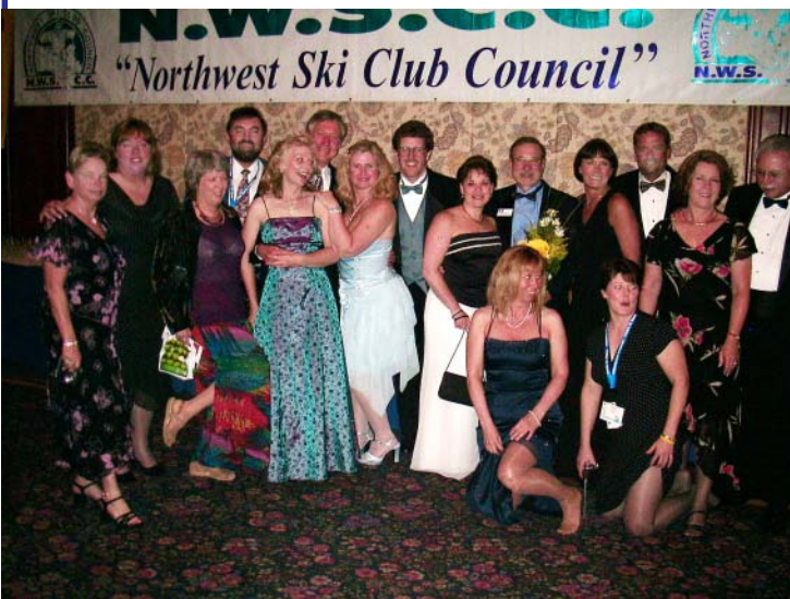
Northwest delegates, from Bergfreunde, Skiyente, Mt. High, Schnee Vogeli, Altair and Cabernet ski clubs.