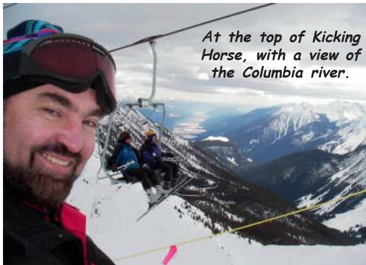
At the top of Kicking Horse, with a view of the Columbia river.

I began on the north end, at the town of Golden and the Kicking Horse ski area. You can get there within less than 2 hours from Banff, or within about 4 hours from Kelowna. At the southern end, Kimberley is about 2.5 hours north of Sandpoint, ID.