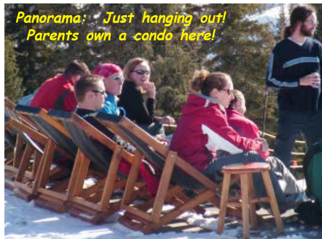
Panorama: Just hanging out! Parents own a condo here!

Personally, I was not happy here. Muddy parking lot, icy slopes, lots of "lodges" but no sign of which one is the day lodge. Also, I got the impression the area is somewhat pretentious. A "Deer Valley" of sorts. Not many places do you see people suntanning themselves on recliners instead of skiing.