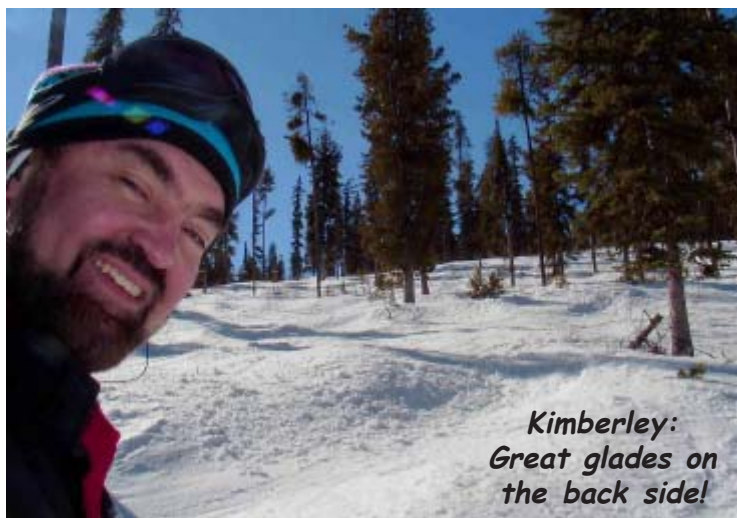
Kimberley: Great glades on the back side!

Kimberley is an intermediate's paradise, with wonderful cruisers on the front of the mountain, but it also has lots of more advanced options on the back of the mountain. In some ways it is the reverse image of Kicking Horse, where the advanced terrain is more prominent and you have to search out the easier trails. At Kimberley, the easier trails are in your face, but you can also find plenty of advanced stuff if you can read a map.