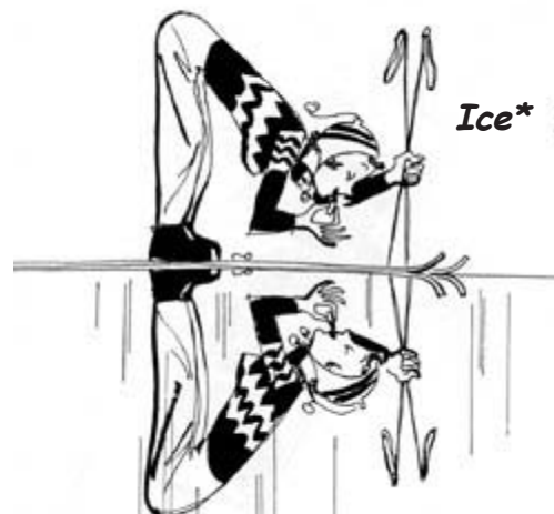
*Often referred to by resort owners as "hard-pack"