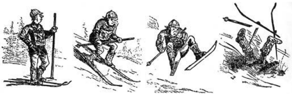
Skiing in the 1800s often ended in a yard sale. Well, not much has changed!!! Except that single-pole technique!

Check out the web site, and if interested in subscribing, send a check for $27 made out to the International Skiing History Association , and mail it to Emilio Trampuz , 4742 Liberty Rd. S., #296, Salem, OR 97302. I assume we need to submit our first 10 subscriptions in a single bundle, to show we really are 10.