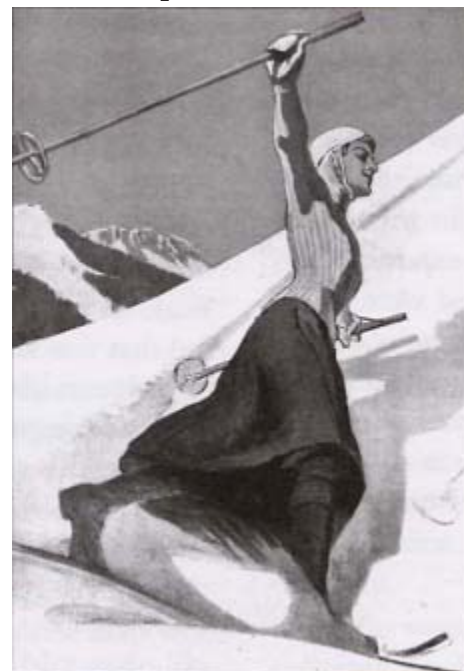
"God how wonderful, I hope this is not just a fad." - German humor tabloid Simplicissimus, 1910

Send us your stories, and your photos from way back then, and we'll publish them.