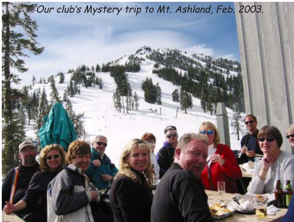
Our club's Mystery trip to Mt. Ashland, Feb. 2003.

Why don't you plan to visit Mt. Ashland this winter and see it for yourself? Mt. Ashland offers "See and Ski" Packages in March 2005 with special lodging, lift, and theatre ticket pricing, as well as discounts on rentals and lessons. Ski Mt. Ashland and see a play at Oregon Shakespeare Festival with group pricing for 15 or more participants. For a brochure, contact Steve Coxen at sacoxen@aol.com .