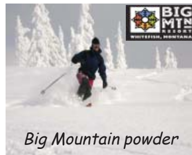
Big Mountain powder

We'll leave Portland, via Amtrak at 4:45 p.m. on Wednesday, Feb. 16 th , arriving in Whitefish, Montana at 7:30 a.m. on Thursday, ready for a day of skiing. After skiing, we'll check into our beautiful rooms at Grouse Mountain Lodge.