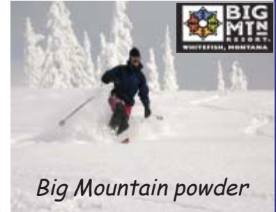
Big Mountain powder

We'll leave Portland, via Amtrak at 4:45 p.m. on Wednesday, Feb. 16 th , arriving in Whitefish, Montana at 7:30 a.m. on Thursday, ready for a day of skiing. After skiing, we'll check into our beautiful rooms at Grouse Mountain Lodge.