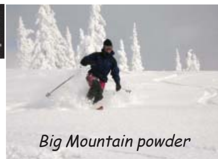
Big Mountain powder

Package rates range from $400 p/p (4 to a room) to $425 p/p (3 to a room); to $475 p/p (2 to a room) for an Executive Deluxe room. Each room has 1 king or 2 queen beds. Additional options: $112 each way for standard sleeper for 2 on Amtrak or $250 for a deluxe sleeper for 2.