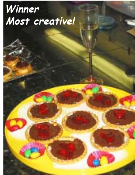
Some champagne with your Chocolate Cherry Tarts?