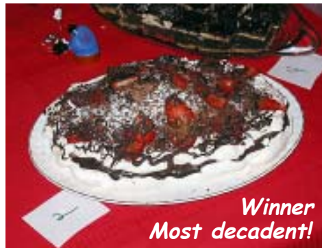
Winner Most decadent!