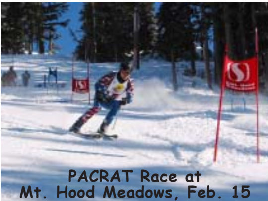
PACRAT Race at Mt. Hood Meadows, Feb. 15

http://www.photorelect.com/scripts/prism.dll?eventframe?event=05JV00170W&start=0&ts=1077698145