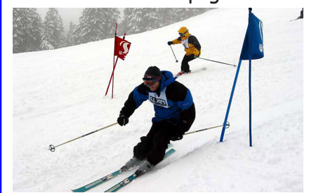
PACRAT 101 - Intro to Racing Dec. 6. See page 3