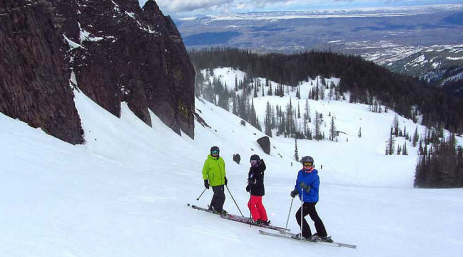
Plan your ski trips (See pages 6 - 10)

Our club is blue. 2023/2024 CALENDAR Mountain High events Blue: Maroon: NWSCC / FWSA / Multi-club Black: General interest events