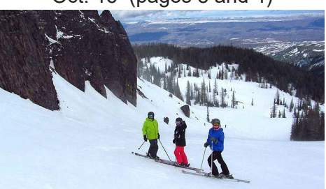
Plan your ski trips (See pages 8 - 11)