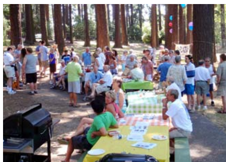
Picnic, Aug. 20