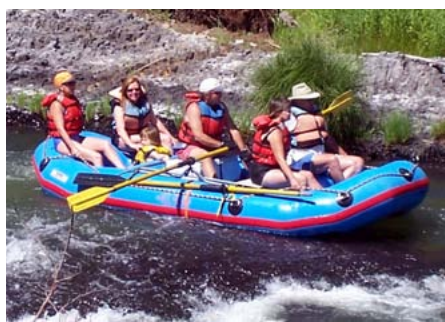
Rafting weekend, Aug 11-14