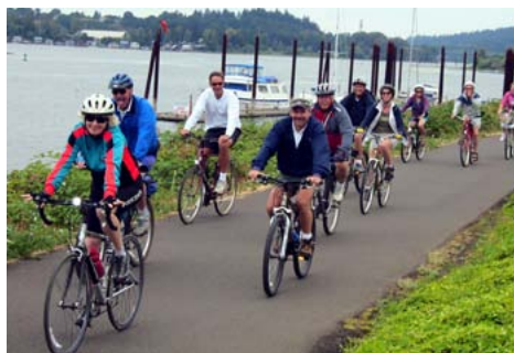
Picnic bike ride: Aug. 20