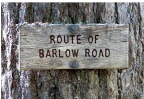
Mt. Hood History bike ride Aug. 6

Please note that there will be no Ski Fair this year. Instead, our club will have a booth at the Portland Ski Fever Show. Your best time to renew your membership will be at the Ski Show (Nov. 4-6) or at our season Kickoff Party (November 7). Or, you can do it by mail at any time, especially if you are signing up early for some of our trips.