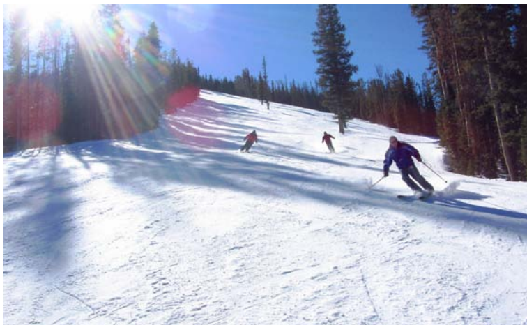
Winning Ridge at Discovery