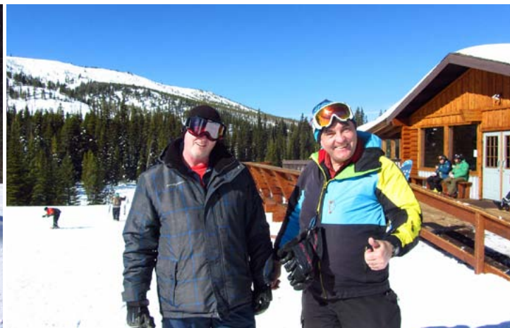
Base area at Lost Trail

See many more photos at www.mthigh.org/Photos.htm .