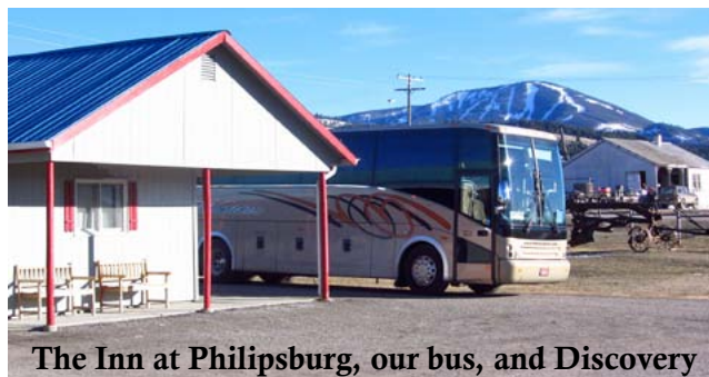
The Inn at Philipsburg, our bus, and Discovery

We visited three ski areas: the Montana Snowbowl , Discovery and Lost Trail Powder Mountain . At the end of the trip, we asked everyone about their favorite ski area among the three. Most people voted for Discovery. Lost Trail was a close second. But there were also several votes for the Montana Snowbowl. All three ski areas turned out to be larger than anyone expected. Lots of vertical, lots of challenge, lots of groomers, lots of variety and no crowds. Best of all, these less well known ski area won't hurt your wallet the way the more famous names will.