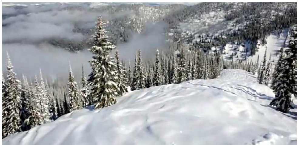
Flower Point ridge at Whitefish. New north facing glades are on the left.

Flower Point ridge can also be accessed from the south side by the Bigfoot T-bar, which operates only on weekends. The new north-side chairlift will operate every day.