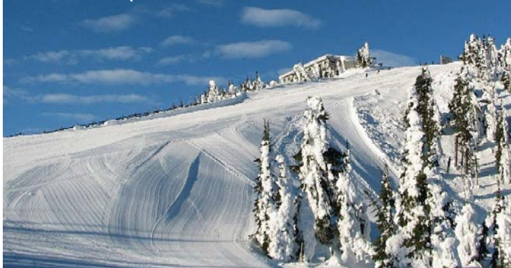
Near the top of Whitefish Mt.

Whitefish trip price includes round trip train seat, 4 nights ski-in/ski-out lodging, 3 day pass at Whitefish, and at least one dinner: