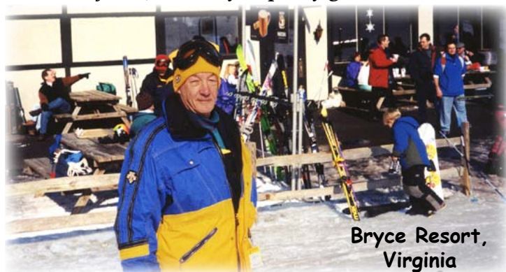
Bryce Resort, Virginia

Day 14. Bryce Resort, Bryce, Virginia. Luck of the lift line paired me on a chair with a boy, six years old. He looked up at me and said, "Sir, are you into penguin jokes?" "I Haven't heard any lately," I replied. "Well, this guy was speeding down the highway with three penguins in the back seat ....". I learned something on Bryce's 500 feet of vertical: Virginia kids say Sir; they tell clean jokes, and they're pretty good skiers.