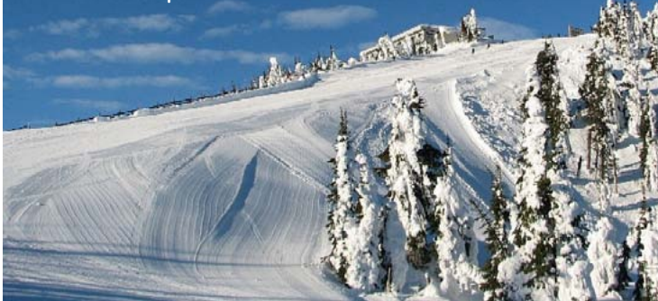
Near the top of Whitefish Mt.

Approximate Whitefish trip cost , including round trip train seat, 4 nights lodging, 3 day pass at Whitefish, and at least one dinner is: