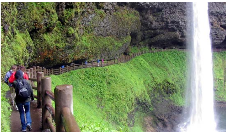
We walked under the South Falls