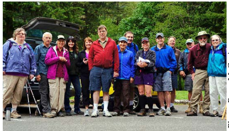
A group picture