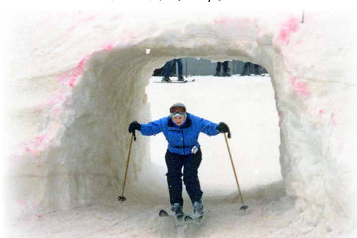
Paoli Peaks, Indiana