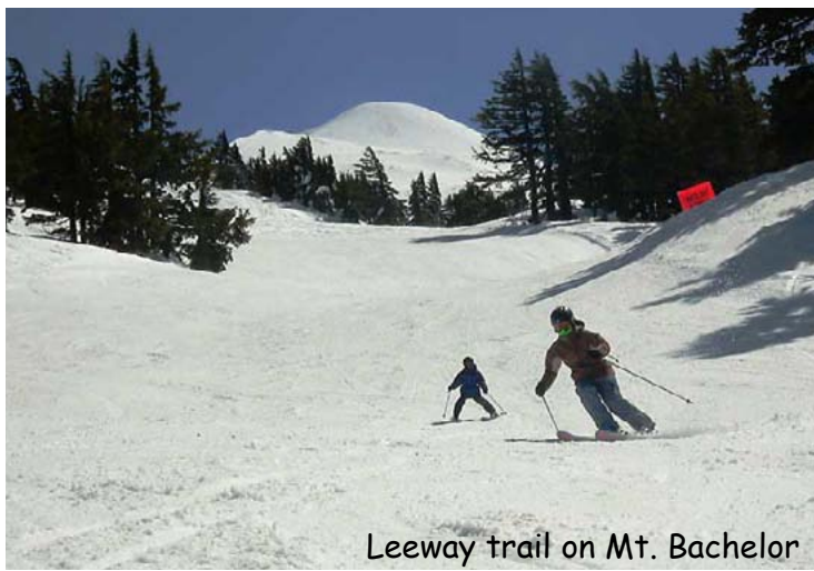
Leeway trail on Mt. Bachelor