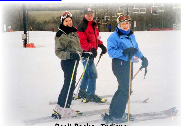
Paoli Peaks, Indiana