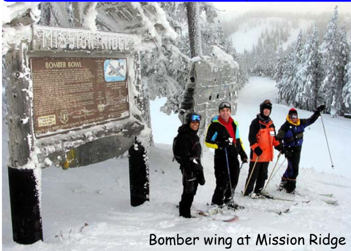
Bomber wing at Mission Ridge

March 21 - 23, 2014. Bus trip. We'll leave Portland on Friday at 4 pm and return Sunday by about 9:30 pm.