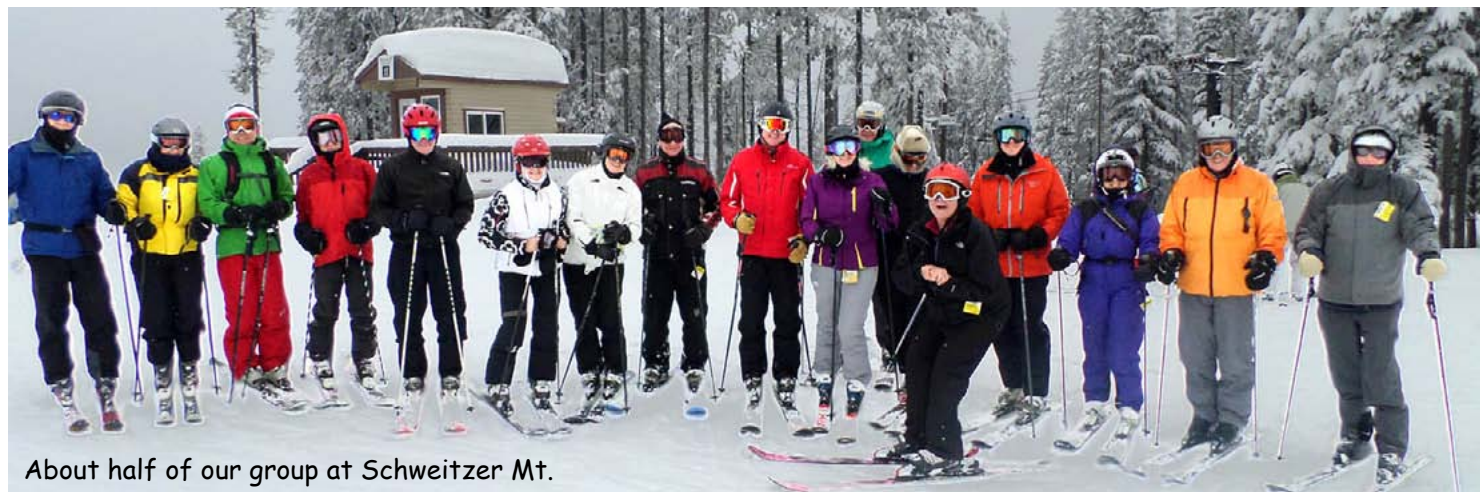
About half of our group at Schweitzer Mt.