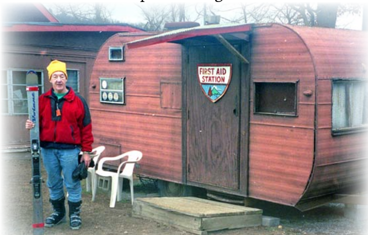
John Andrew First Aid Station, Cloudmont, AL

After several runs we ate lunch in the upper lodge (not shown), which was quite nice. We met the owners, who run a year around dude ranch. We listened to their tragic ski story. Their son was killed on the slopes while tending the snow guns just before their grand opening in 1970. They opened on schedule in his honor. We left Cloudmont with great respect for a family that has put Alabama on the map as a skiing state.