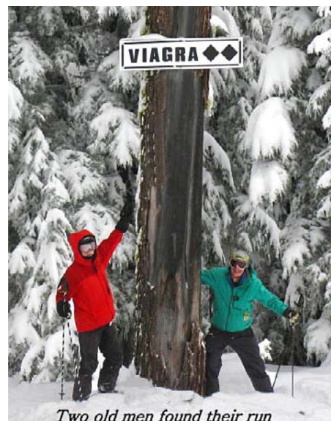
Two old men found their run Bruce and Kay at Lookout Pass