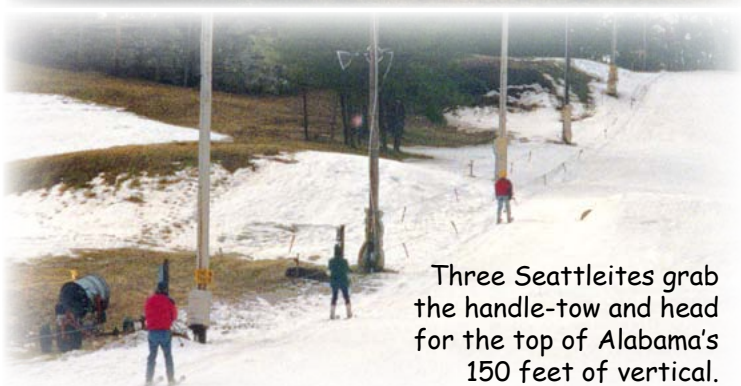
Three Seattleites grab the handle-tow and head for the top of Alabama's 150 feet of vertical.