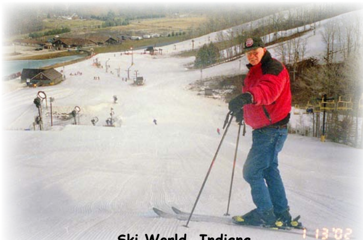
Ski World, Indiana