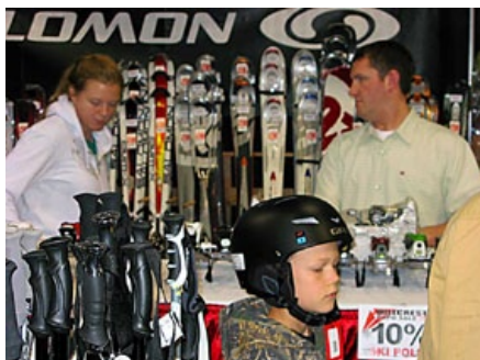
Ski Swaps (Oct. 4, 5, and 12)