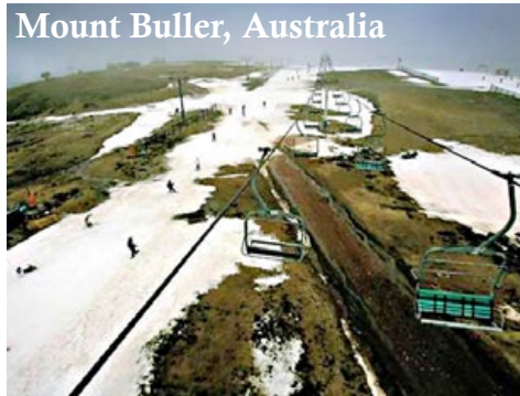
Mount Buller, Australia