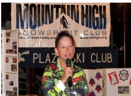
Kickoff Party (Nov. 20)