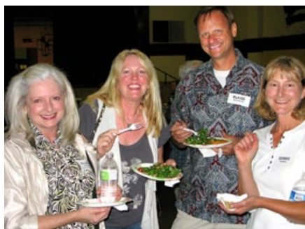
Seafood Social (Oct. 12)