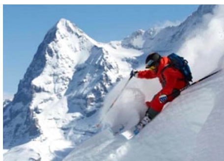
Warren Miller dinner+movie (Oct. 25)