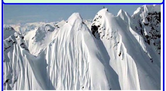
Sept. 15 (Sat.) 6:30 pm & 9 pm.

Teton Gravity Research brings their latest movie "Further" in a trilogy called: Deeper, Further, Higher. This film focuses on backcountry skiing in places where no one has skied before.