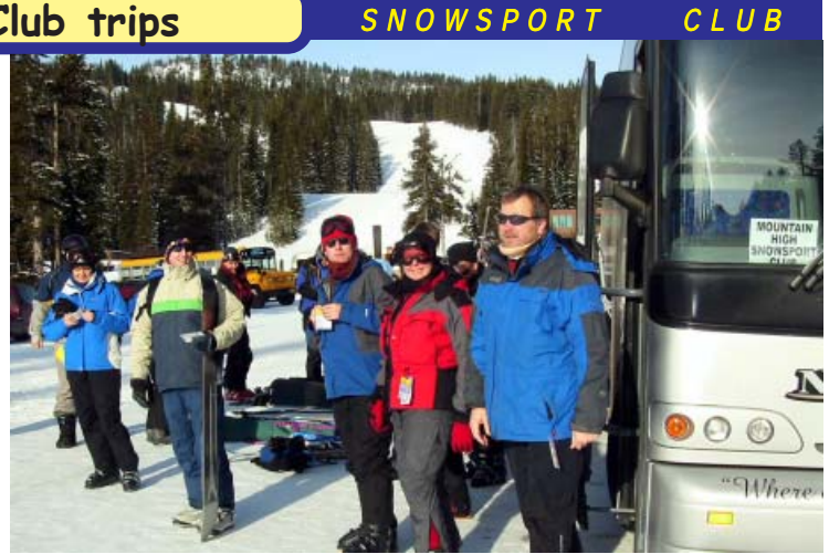
The Interesting & Educational