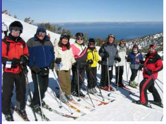
Mt. High members at Heavenly

Come join us for fun on the sunny, snowy Lake Tahoe trip. Heavenly was rated tops for tree skiing in this year's Skiing magazine.