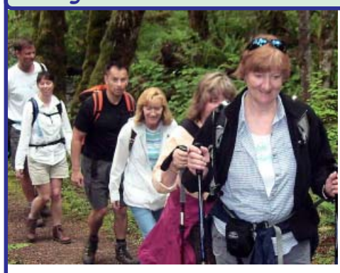
Sellwod Riverfrontto Johnson Creek Loop