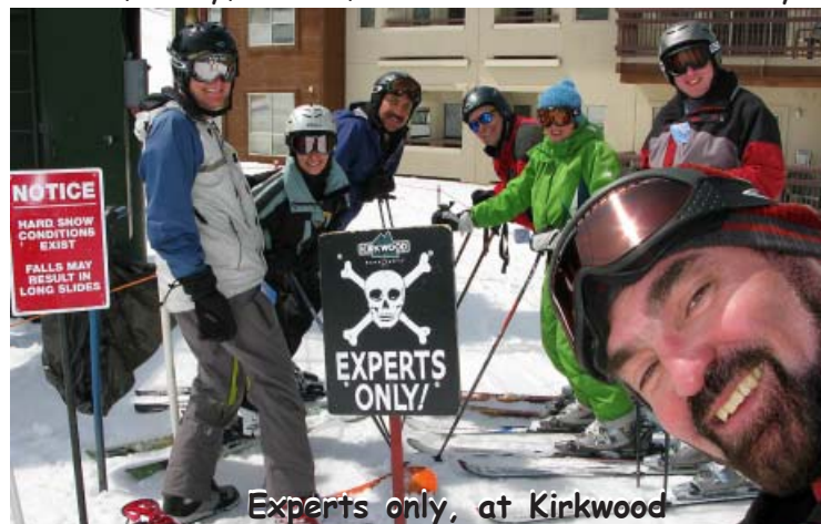
Experts only, at Kirkwood