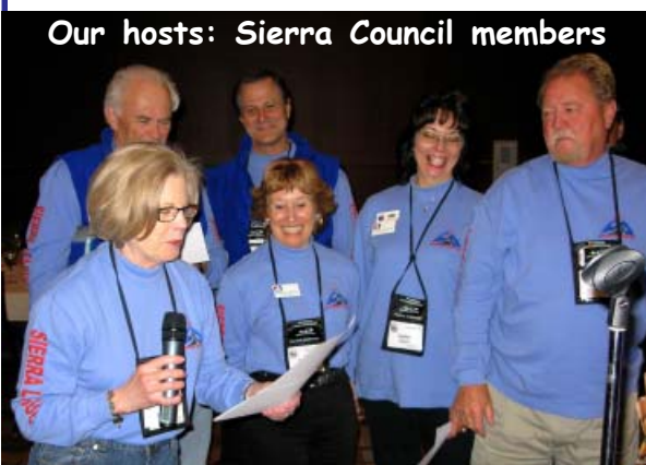
Our hosts: Sierra Council members