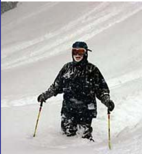
Chuck up to his knees!