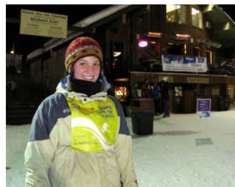
All night? No problem!