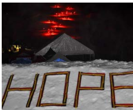
Torches approaching the HOPE sign