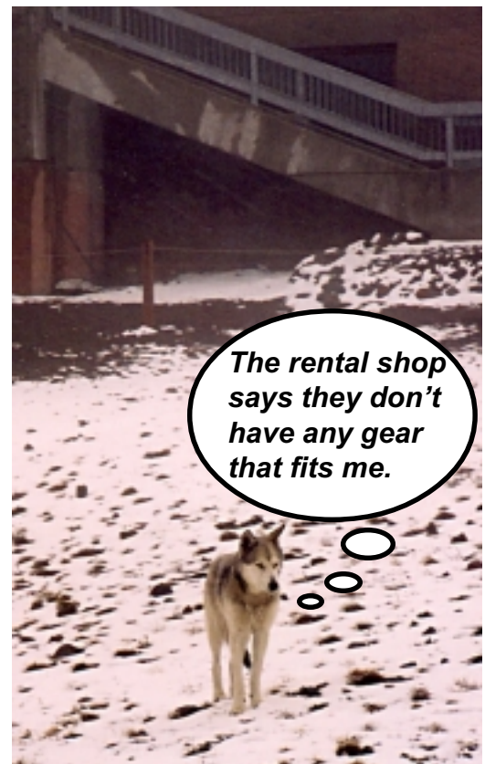
The rental shop says they don't have any gear that fits me.