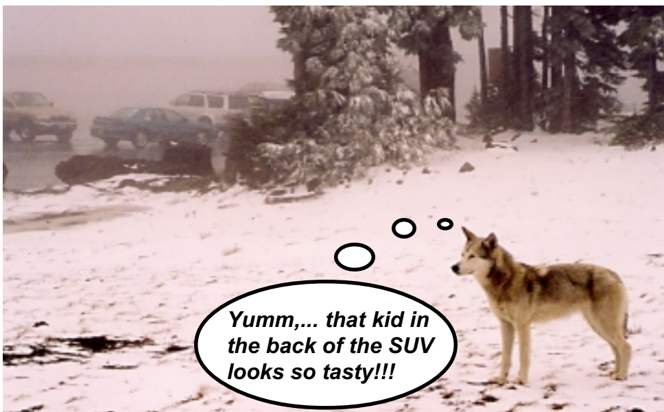
Yumm,... that kid in the back of the SUV looks so tasty!!!