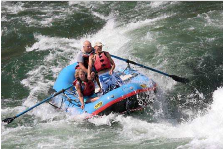
It gets wet on our annual Raft trip on the Deschutes River.

Presentation style is maintained throughout all articles and flyers.