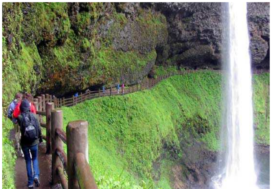
Just one of the many falls

June 1, 2014 (Sunday). Twenty one folks hiked to 9 of the 10 waterfalls at Silver Falls State Park. It was perfect hiking weather, warm but not too hot. Great views of the waterfalls. We took lots of pictures. Chris (the leader) treated us to some snacks both before we started on the hike as well as at the end.