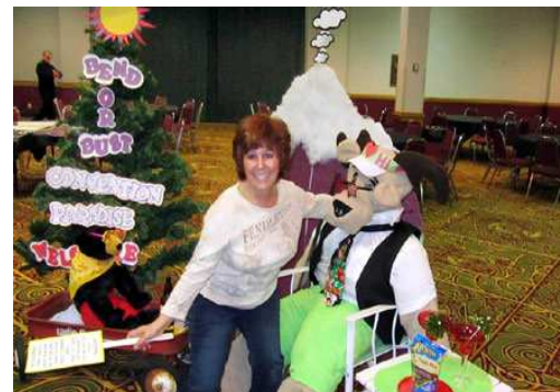
Mt. High Ski Fair booth promoting 2014 FWSA Convention