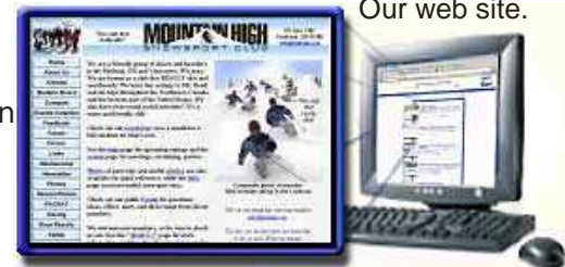
Our web site.