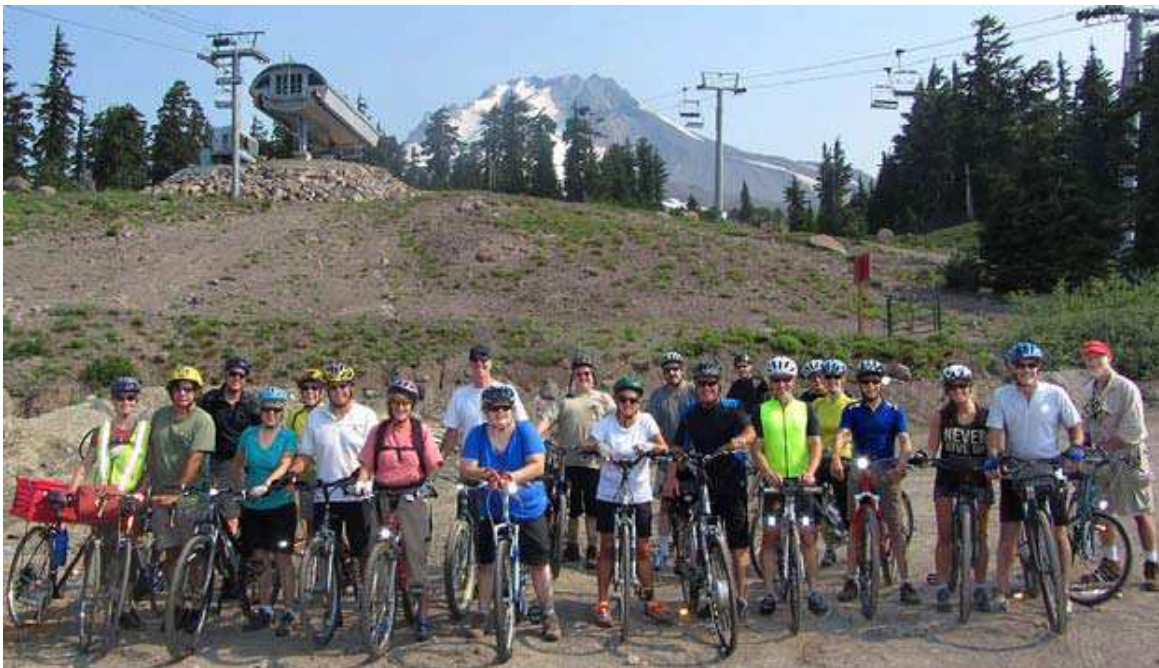
Start of ride at Timberline Lodge Ski Area.

August 2, 2014 (Saturday) - 22 people participated. Rest of text follows photos