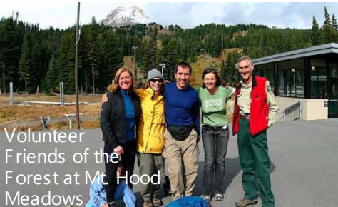
Volunteer Friends of the Forest at Mt. Hood Meadows

Each year, many Mountain High members participate in The Candlelighters' cycling fundraiser, Ride-for-a-Child, and the week long Cycle Oregon in September.