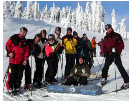
Mt. High members at Big White