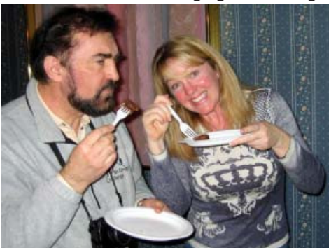
Chocolate Party contest judges