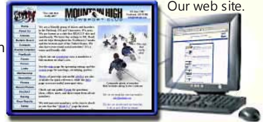
Our web site.