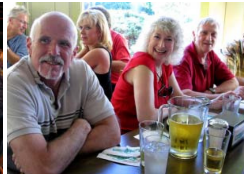
Socializing at a Pizza party