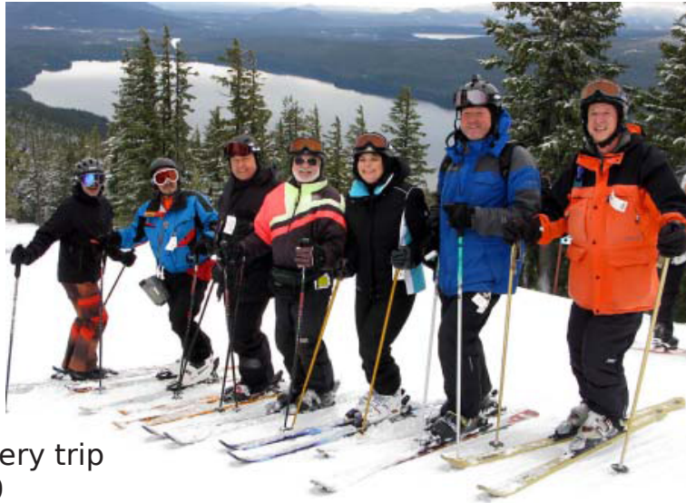
Mystery trip 2010

Club Category: AAA Number of Members: 283