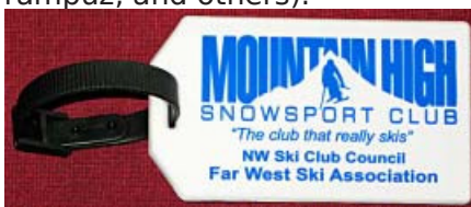
Luggage tags distributed at FWSA 2008 Convention in Bellevue.