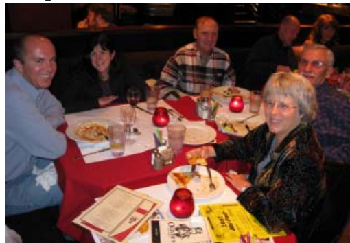
Warren Miller dinner and movie