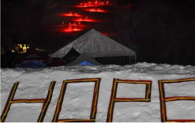
Our members participated in the torchlight parade and the 24-hour skiing fundraiser for the American Cancer Society Friends of the forest cleanup day