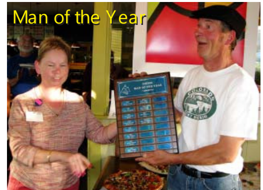
Man of the Year